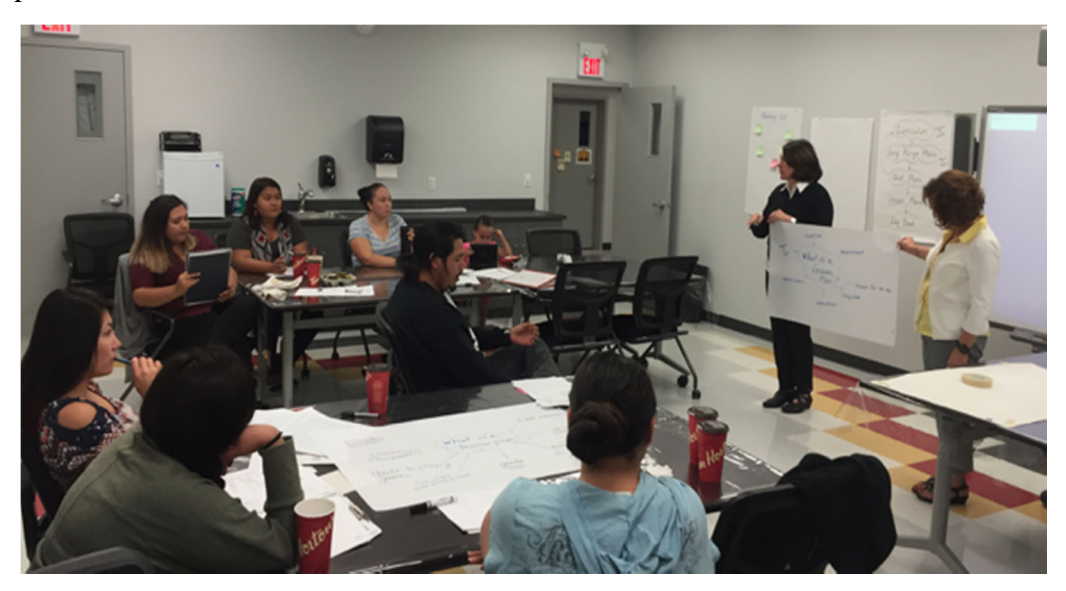
Figure 3: Tsuut'ina Gunaha Instructors' Workshop

The second principle states that the collaboration provides opportunities for cocreation in the sharing of decision making, data management, and knowledge. The scope and sequence document was co-created through our work with the Tsuut'ina Gunaha instructors. The process began with us seeking clarity about their requirements. Within those conversations, we identified a need for linguistic components for instruction at each grade level. We incorporated the feedback into the development of a draft scope and sequence document. We worked together with the instructors to complete the final version of the document (see Figure 3). The language instructors gave a final approval to the scope and sequence document.