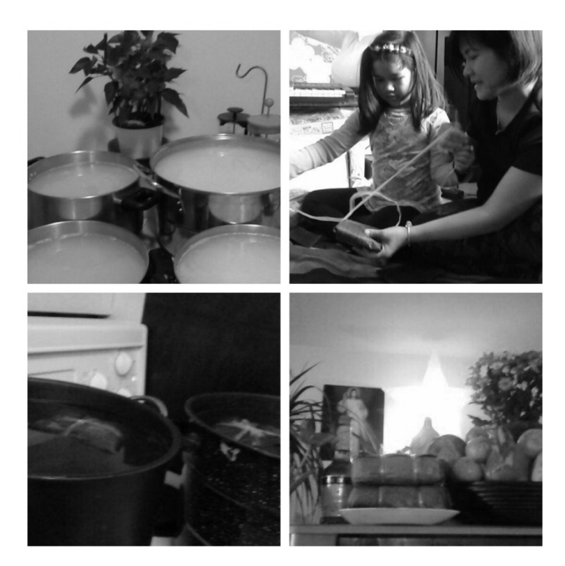
Figure 1. Photo collage of making Chung cakes, taken Lunar New Year 2018

Because cooking has been a thousand-years tradition of our people, it plays an essential role in Vietnamese family life. Being inspired by this lengthy tradition, I wrote a poetic fragment denoting our kitchen, where different female generations of my great family as well as other Vietnamese families have been sharing knowledge and love to each other.