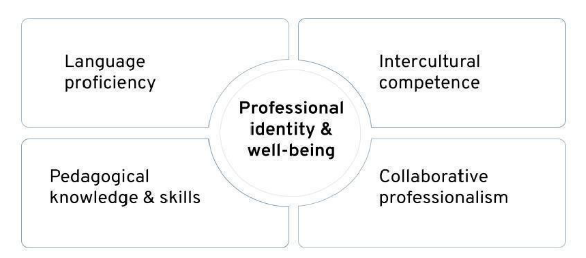
Figure 2 The Four Pillars for Success in FSL Teacher Education