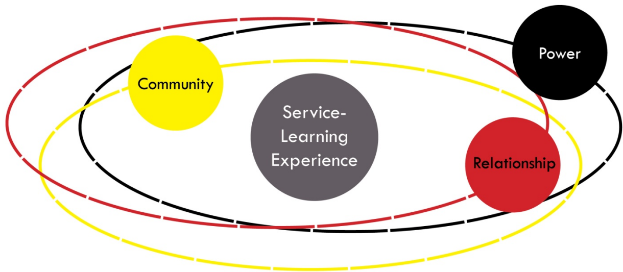
Figure 2: Reflexive Service-Learning Model for American Indian College Students

The responsive circles can be understood to move within and all around each other as the mentoring experience affects how closely the circles align with one another. The concept of Indigenous knowledge organic by nature and this model is not intended to explain all facets of this knowledge base. It is, however, helpful by showing that all the participants had their own interpretation of the three areas: relationship, community, and power. It is also helpful in understanding that a student's interpretation changes as he or she experienced new situations, so a student's placement on the circular track may move closer to an Indigenous Knowledge perspective or vice versa.