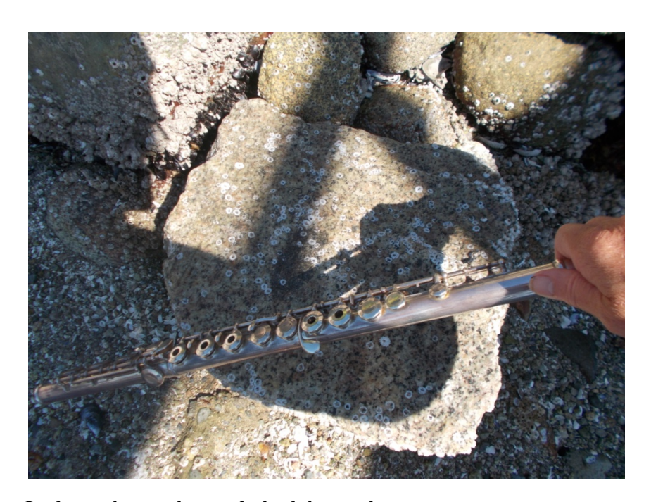
I release the need to seek, look beyond, because the answers are always right here somewhere near us and I reflect on my next choice to express Pedagogy transmits sustainability and sustainability transmits and translates pedagogy

Live in your hearing mind, the yogi shares